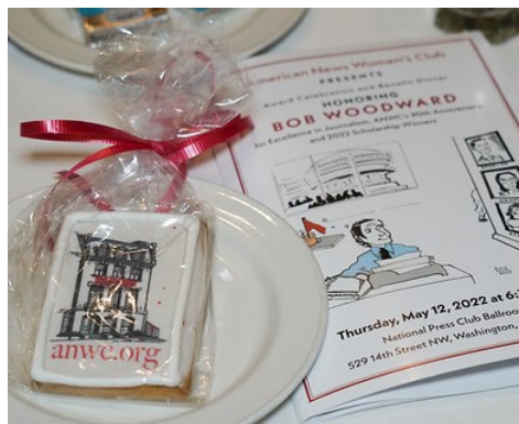
ANWC's 90th Anniversary celebration cookie and program with cartoon by Anne Ganz .