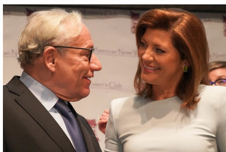
Bob Woodward and Norah O'Donnell .