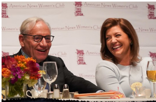
Bob Woodward , EIJ Awardee '22, and CBS News' Norah O'Donnell enjoy the festivities at the Press Club.