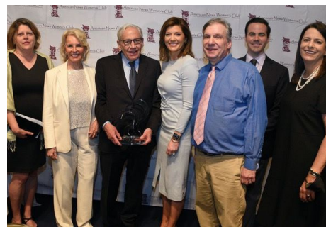
All-Star Lineup for ANWC's Benefit Dinner Honoring Bob Woodward for Excellence in Journalism includes, (l-r) Sally Buzbee , Sally Quinn , Bob Woodward , Norah O'Donnell , John Feinstein and Robert Costa .

CBS News' Norah O'Donnell and EJU recipient 2015 did a fantastic job emceeding the evening. Washington Posts, Sally Buzbee , Sally Quinn, and John Feinstein along with CBS News' Robert Costa all gave both touching and hilarious speeches about their individual relationships with Woodward.