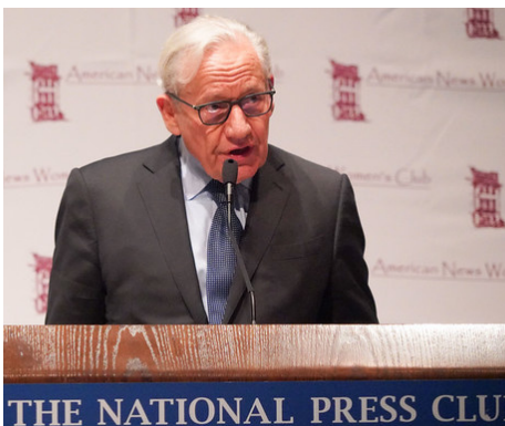
Bob Woodward addresses the ANWC with a focus on the great women in his career who have supported him beginning with Katharine Graham.